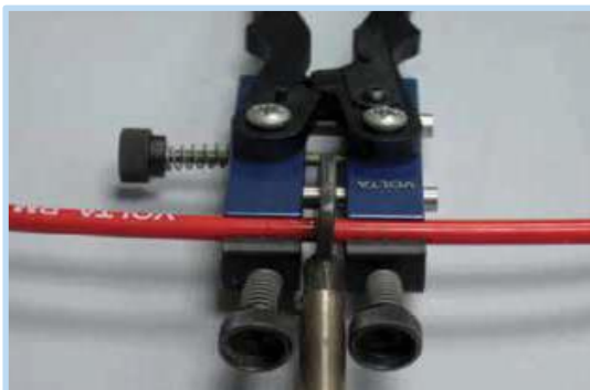
R8 Mini Pliers for smaller profiles