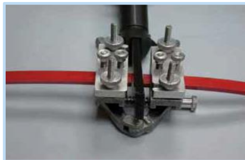
F51 Pliers for larger profiles