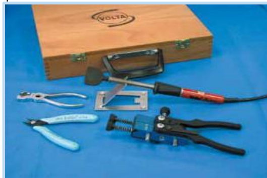
Kit for small profile welding